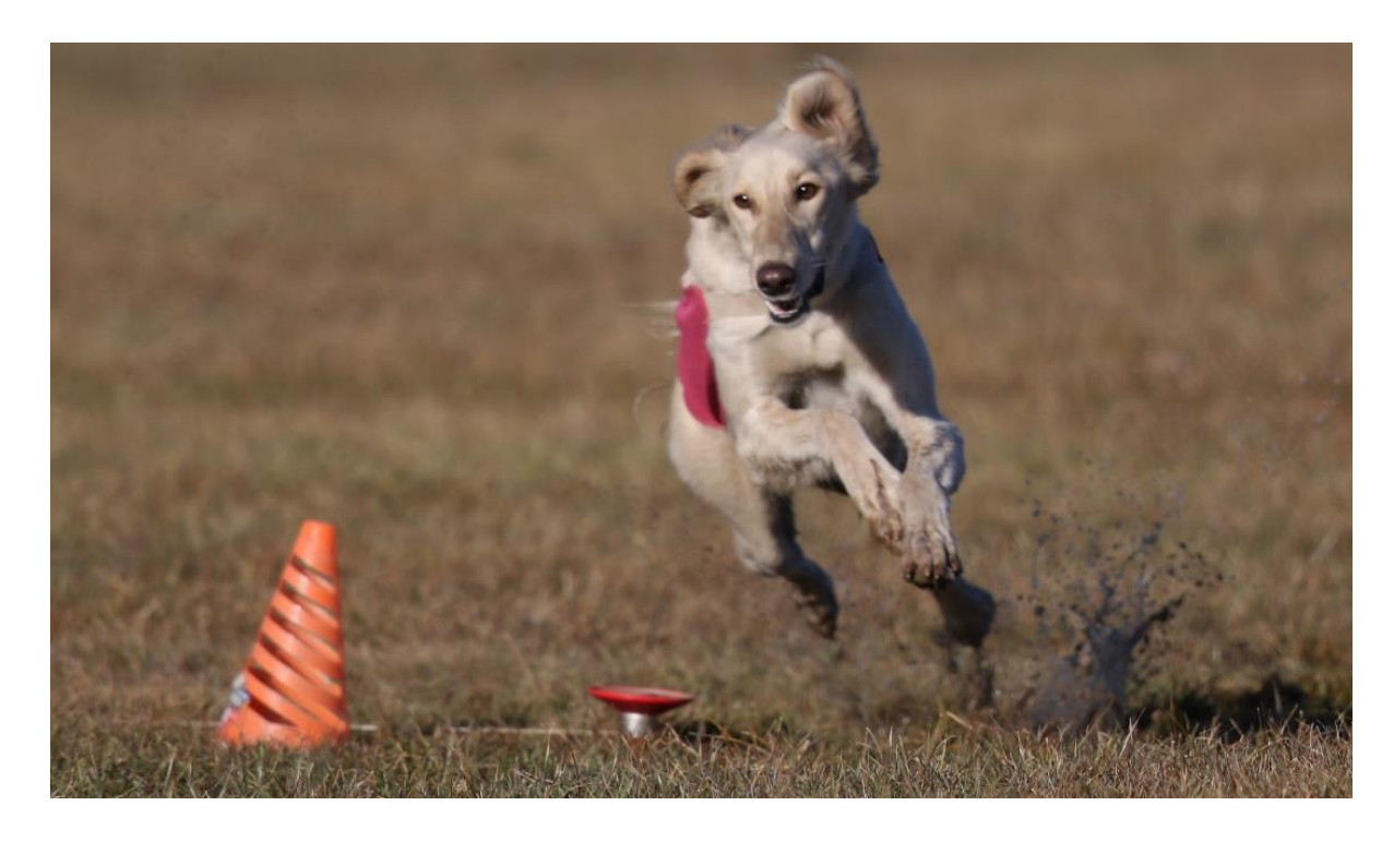
We'll be there again at the end of 2019. For a great time for you and your hounds, come to Hanover, PA next December 28, 29, 30 and 31<sup>st</sup> to wind up 2019.

Eight hounds were present that would end up as the #1 ASFA Hounds in their breeds for 2018, including Afghan Hound "Typsy", Basenji "Chilly", Greyhound "Tull", Ibizan Hound "Ensign", Pharaoh Hound "Cayper", Rhodesian Ridgeback "Jinx" and Scottish Deerhound "Avery".